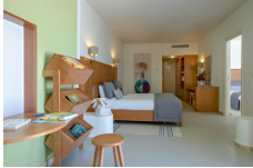
Calimera Room approx. 38 qm, for families, in the special Calimera design with children's play corner and the Summer Rack, an extra shelf for more storage space. 2 bedrooms with connecting stür, 1 bathroom