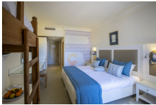
Family Room ca. 31 qm, additional bunk beds