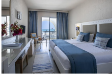
Double Room approx. 31 qm

The rooms are equipped with bathroom, shower or bathtub, WC, air conditioning (no charge 15.6.-15.9.), heating (15.11.-15.3.), safe, TV, minibar (for a fee), balcony or terrace.