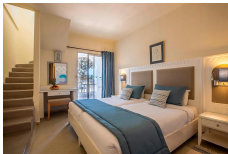
Family Room Superior approx. 58 qm, 2 bedrooms connected by 2 floors with a spiral staircase, 2 bathrooms